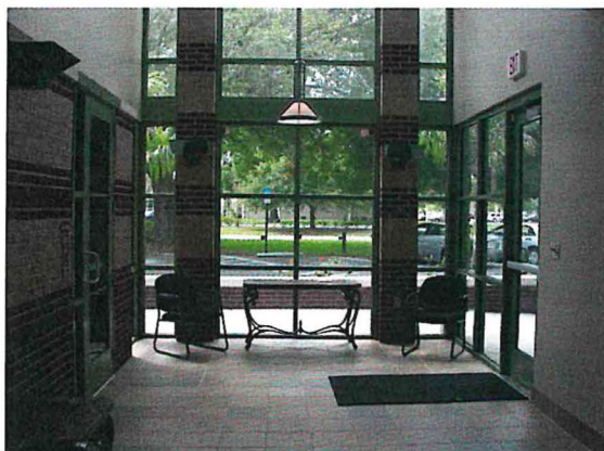
Entrance to lobby from McFarland Road