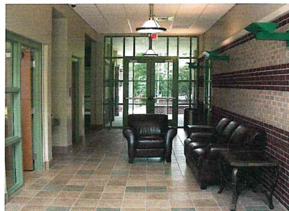
Entrance to lobby from tennis courts