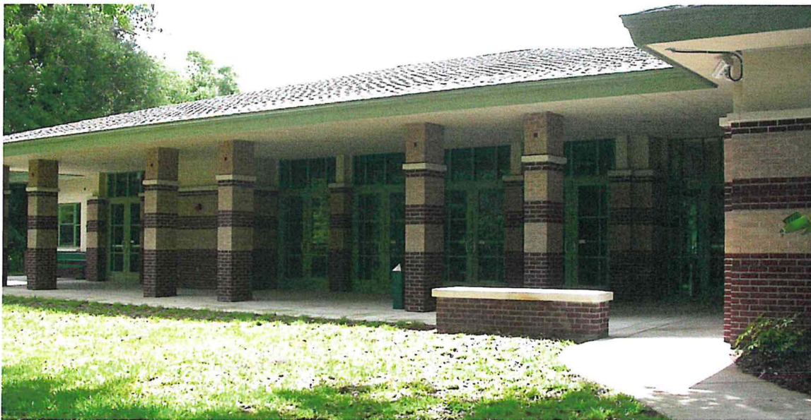
Recreation Center south elevation from the tennis courts