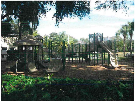
Renovated pavilion and Playground—October, 2008

Built in 1964, the original site of Carrollwood beach and boat ramp. Renovations completed in October 2008. Key access required.