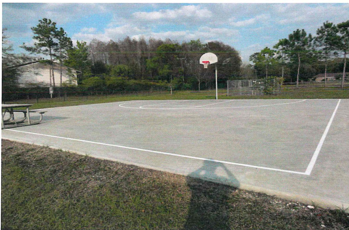
Original Carrollwood Park - September 2010