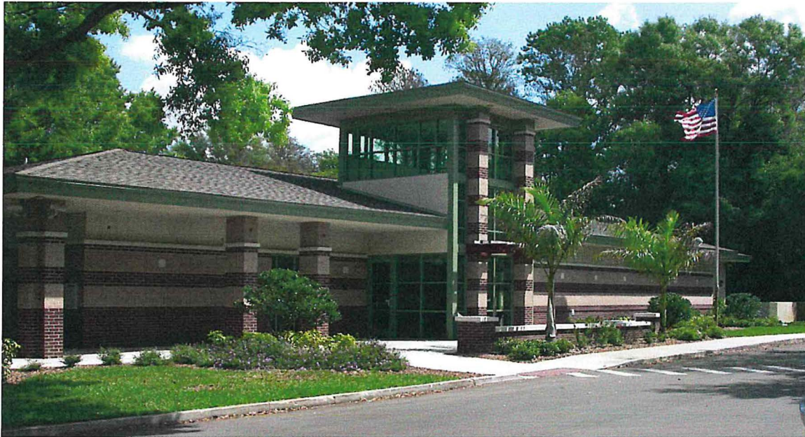
New Recreation Center (South Elevation)—officially opened June 16, 2007