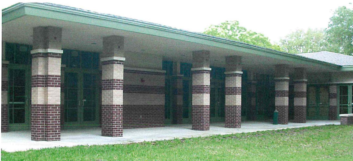
Covered patio outside multi-media room on north side