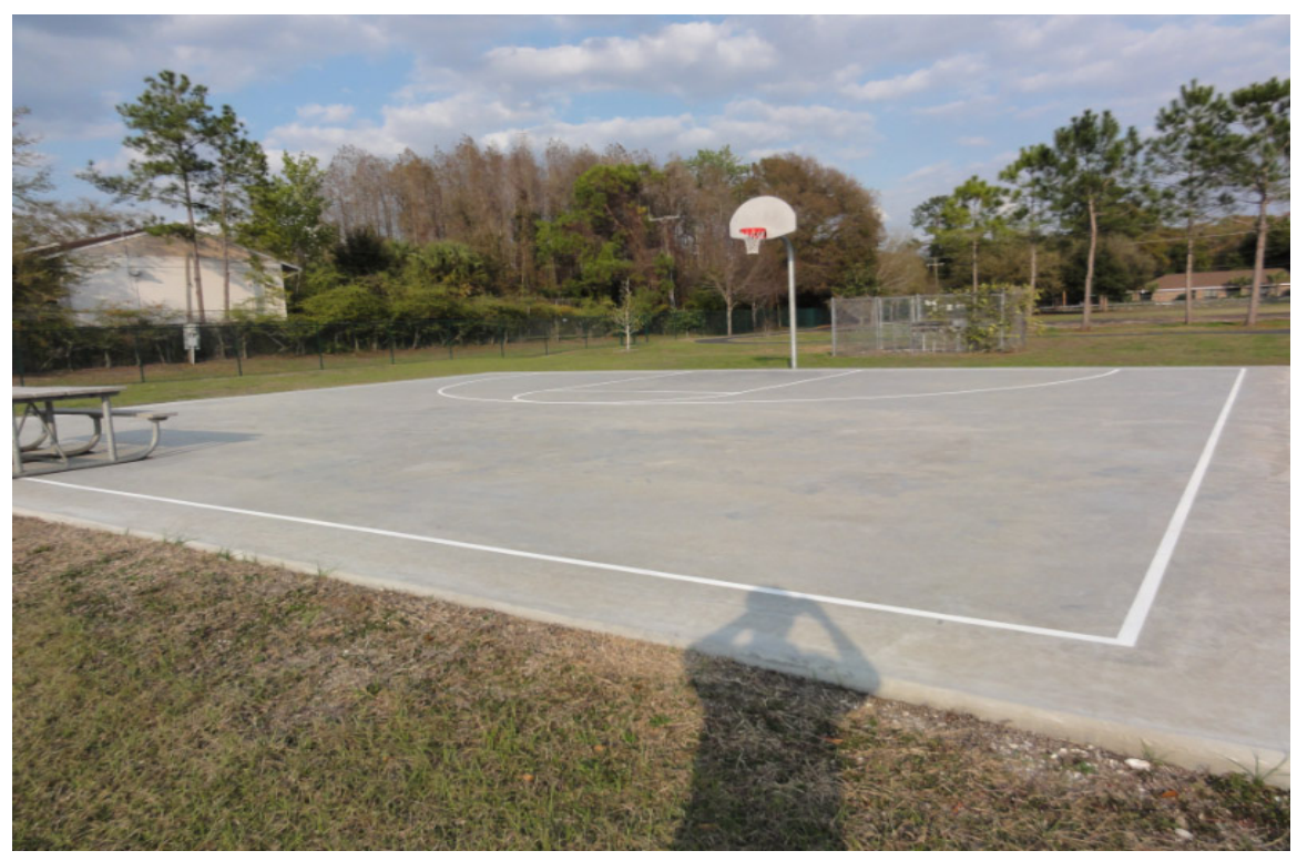
Original Carrollwood Park - September 2010