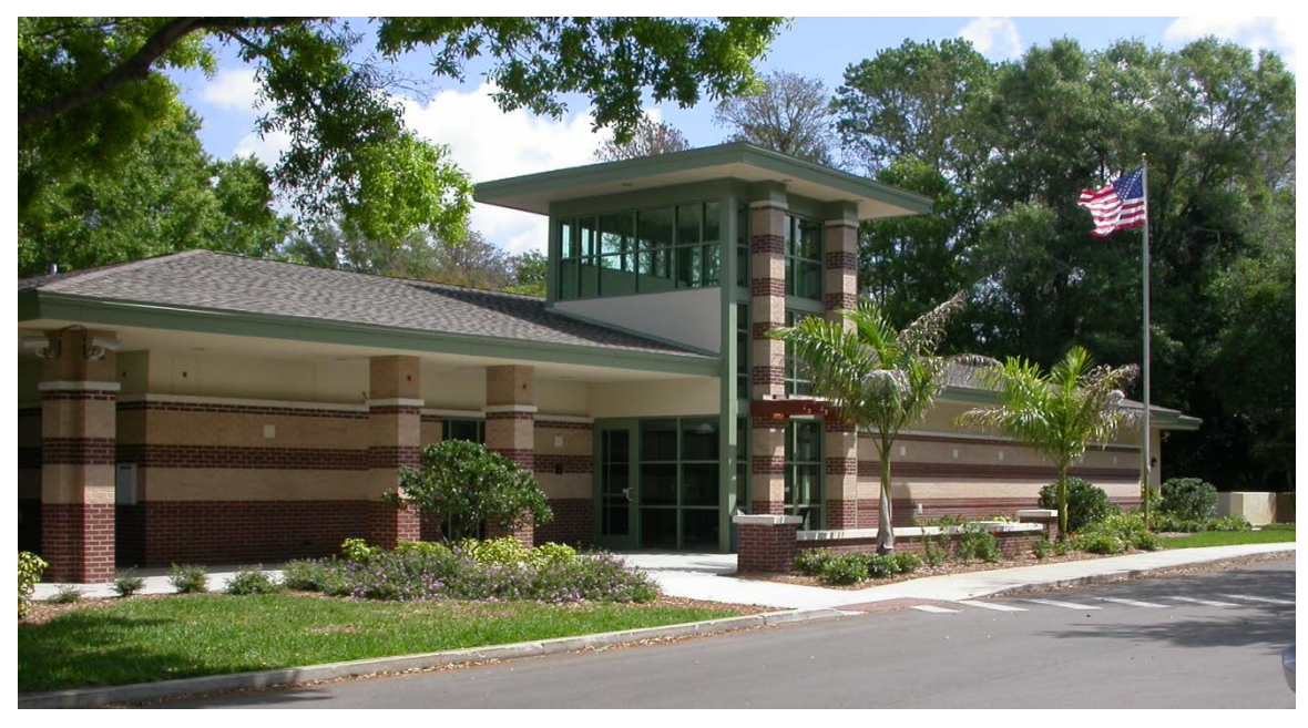
New Recreation Center (South Elevation)—officially opened June 16, 2007