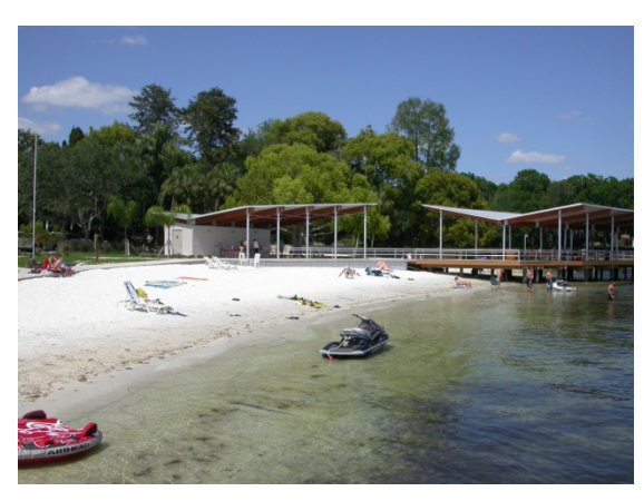
New pavilion, docks, and landscaping-May 2007 & April 2008