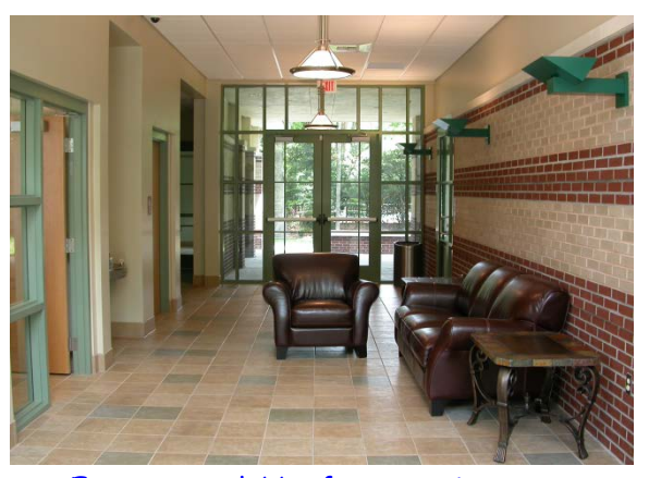
Entrance to lobby from tennis courts