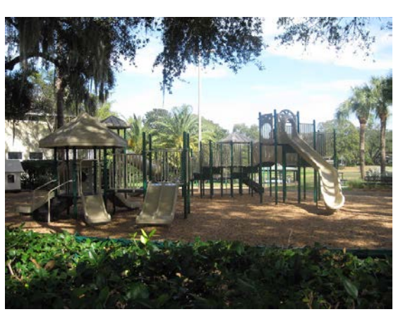
Renovated pavilion and Playground—October, 2008

History: Built in 1964, the original site of Carrollwood beach and