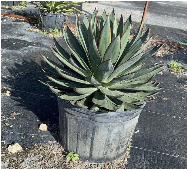
Agave "Blue Glow" – 7gallon, 14" $30 wholesale