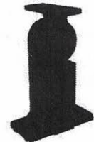
LA1-AD-BZ Adjustable Mount Bronze