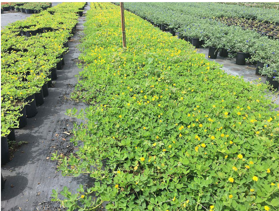
Perennial Peanut – Arachis glabrata , 1gal. 6", $2.