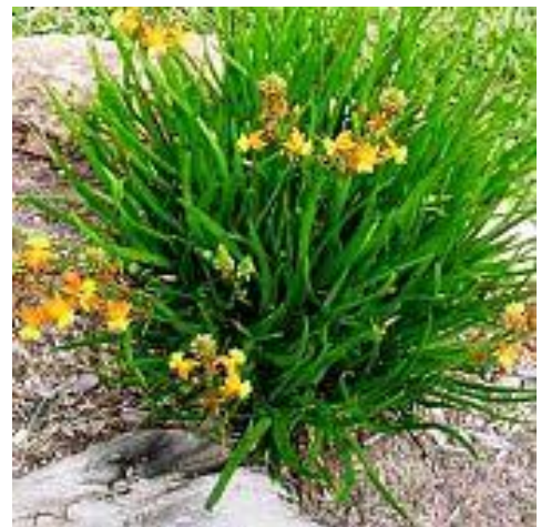
Dwarf Bulbine frutescens – Hallmark, 1 gal. $2.50 wholesale