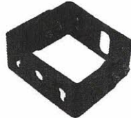
LA1-TR-BZ Trunnion Bronze