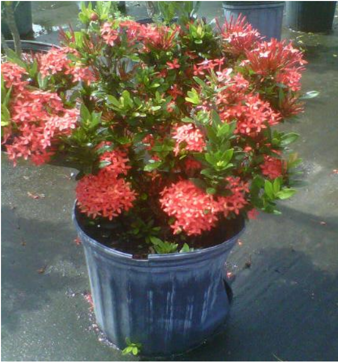
Ixora Coccinea Taiwanensis – Dwarf Red, 3 gal., $5.