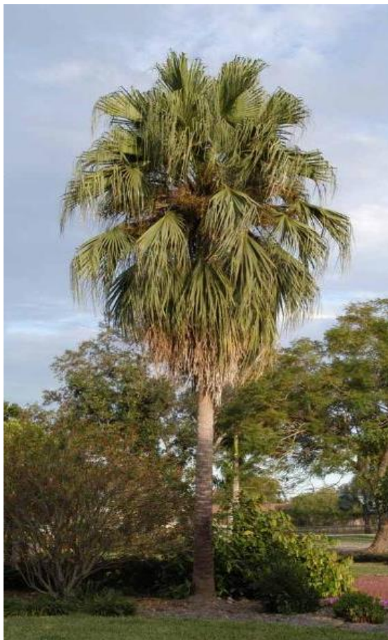
Livistonia chinensis – Chinese Fan Palm, Mature at 15 to 25'. Slow grower. Hardy in zones 9-11. 65 gal., single trunk, $200 wholesale. ALTERNATE TO FOXTAIL PALM