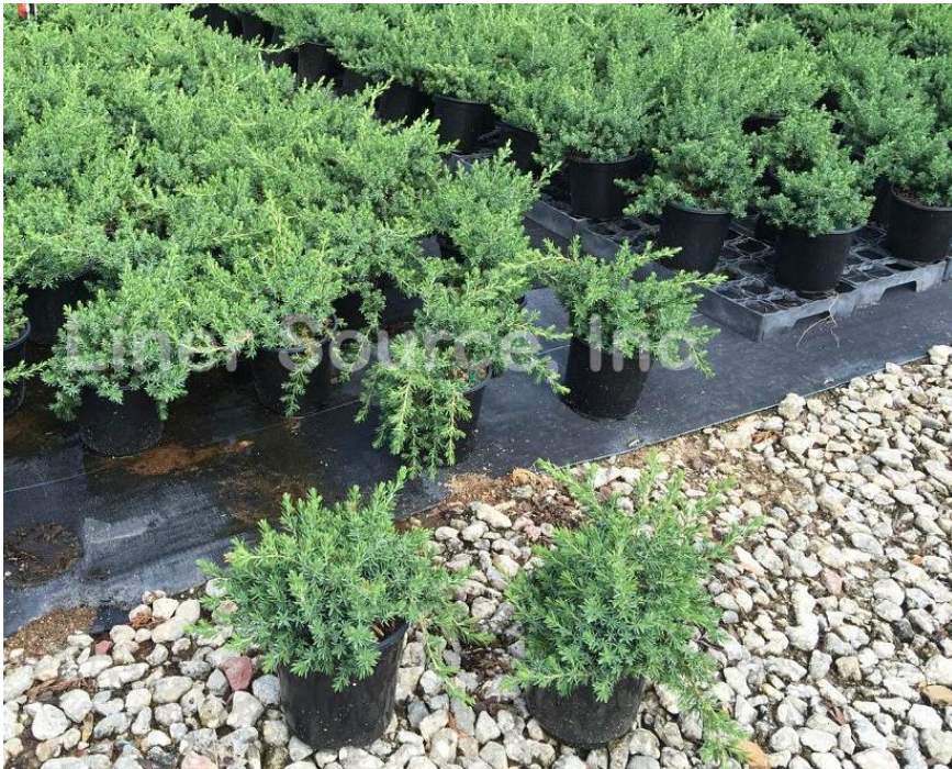
Shore Juniper - Juniperus conferta "Blue Rug", 1 gallon container, $4 wholesale