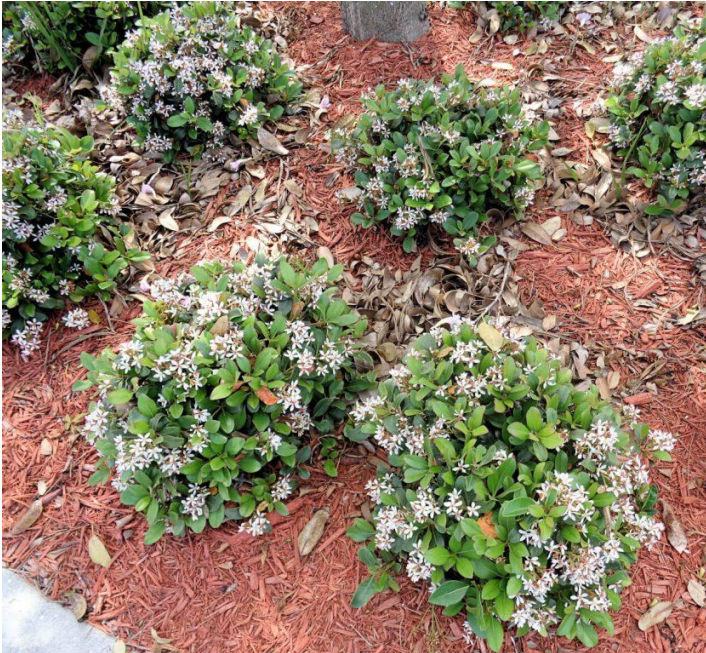
Raphiolepis indica – Indian Hawthorn, 3 gal. $5.