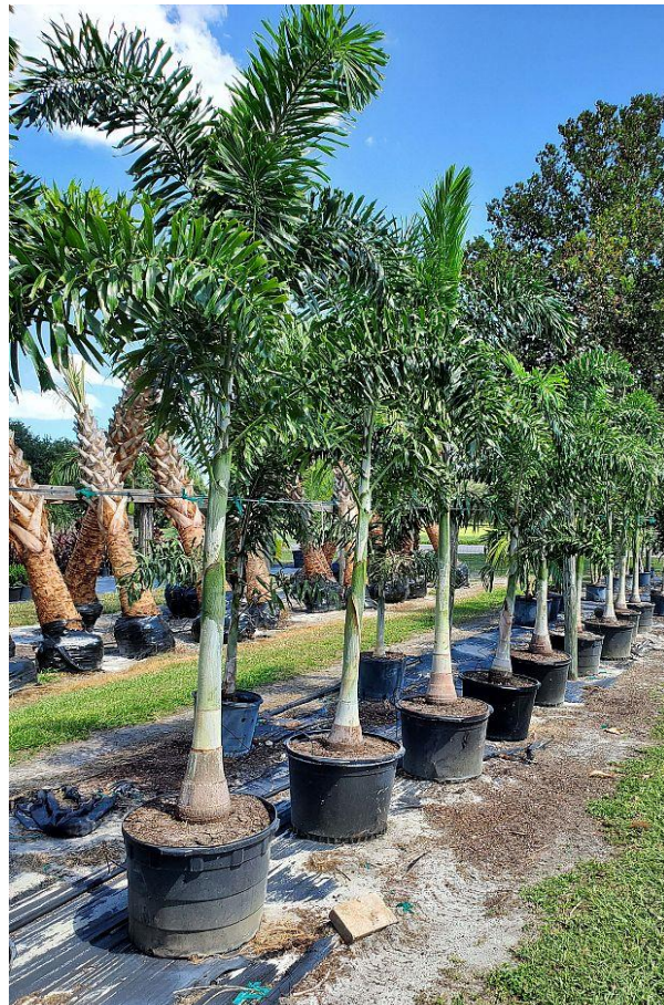
Wodyetia bifurcata – Foxtail Palm, 30 gal. 10' hgt, $100 Fast growing can reach 30' height Spread is 15-20'. Hardy to 27 degrees.