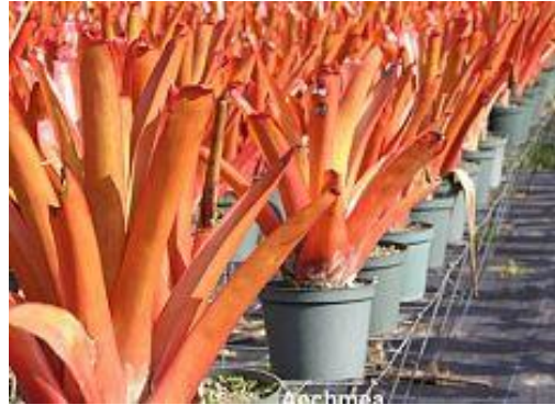
Aechmea blanchetiana – orange, 3 gal., $15