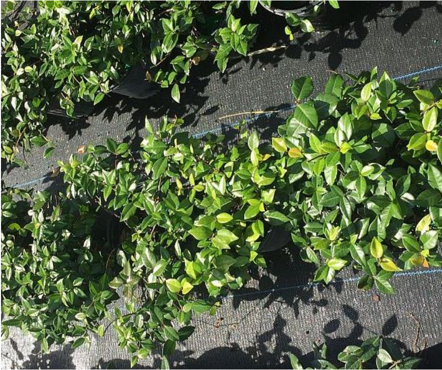
Dwarf Asian Jasmine – 1 gal., Bronze Beauty or variegated, $2.