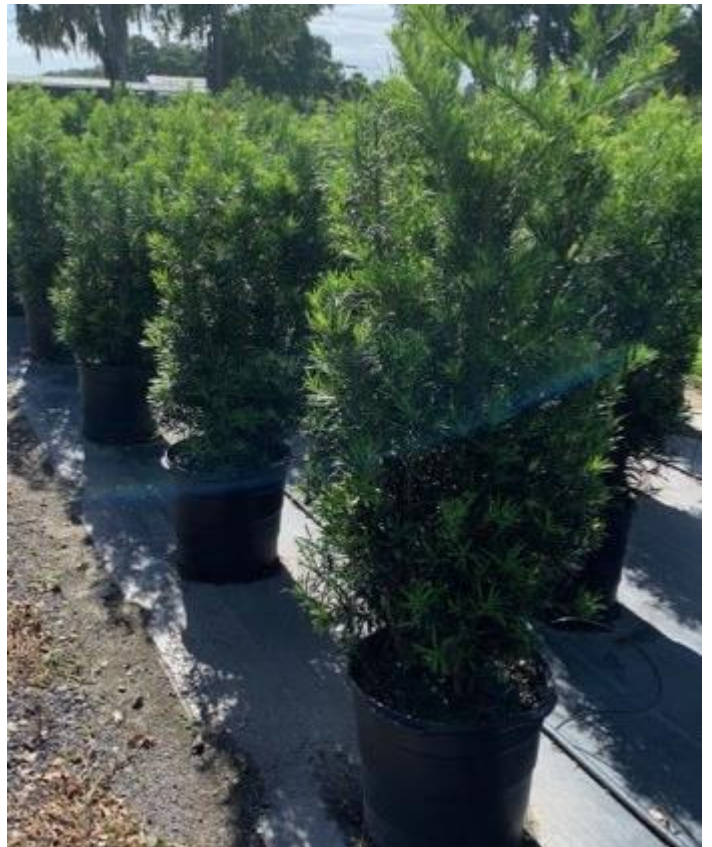
Podocarpus Macrophylla – 15 gal. 4'-5' tall, 2' spread, $35.