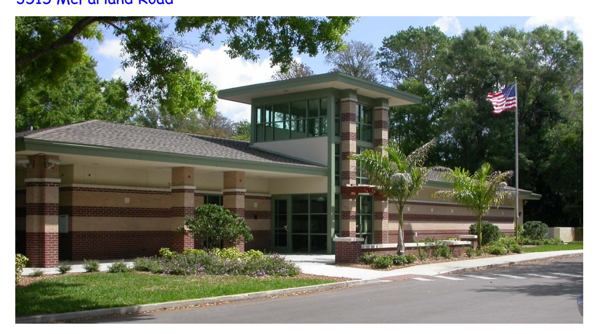
New Recreation Center (South Elevation)—officially opened June 16, 2007