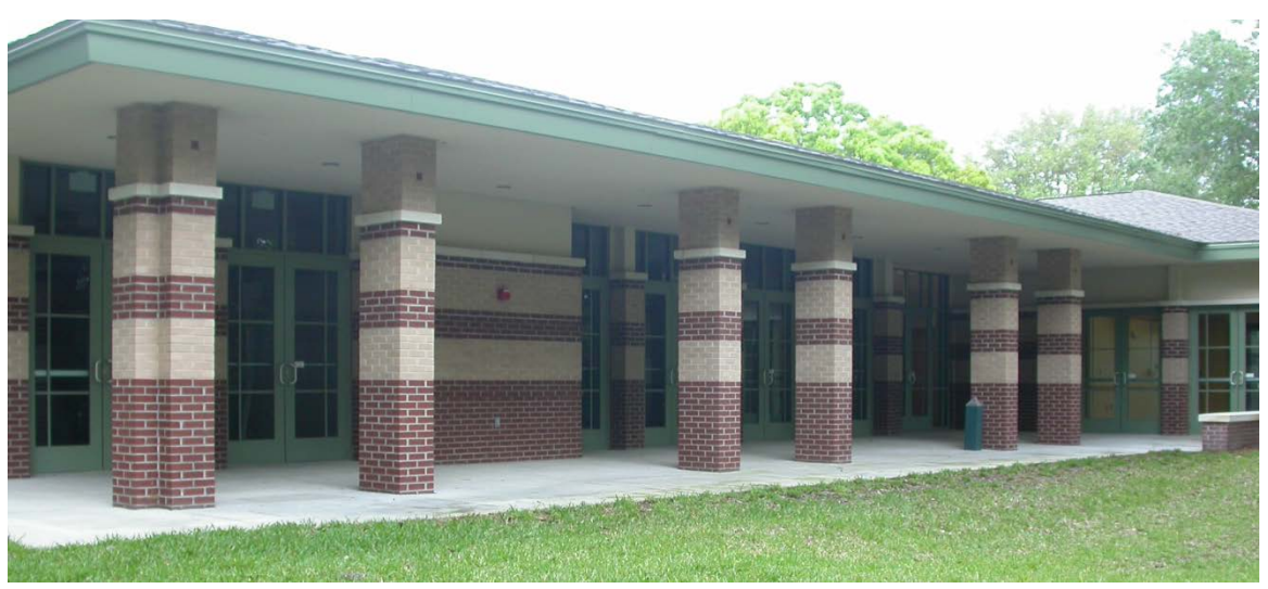
Covered patio outside multi-media room on north side