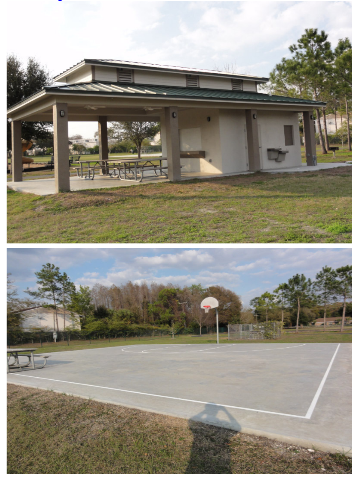
Original Carrollwood Park - September 2010