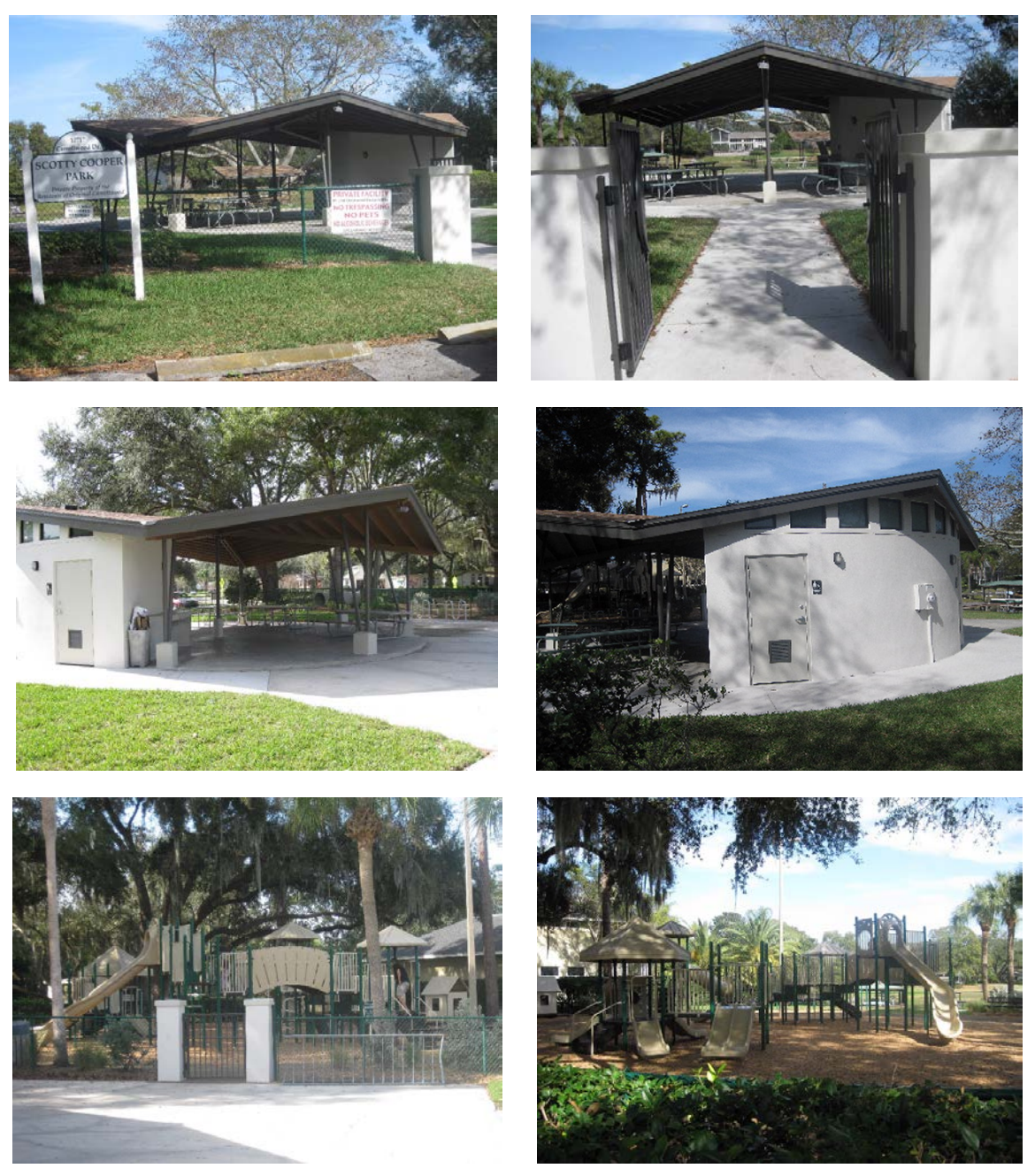
Renovated pavilion and Playground—October, 2008