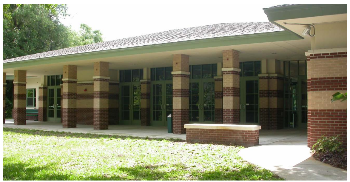
Recreation Center south elevation from the tennis courts