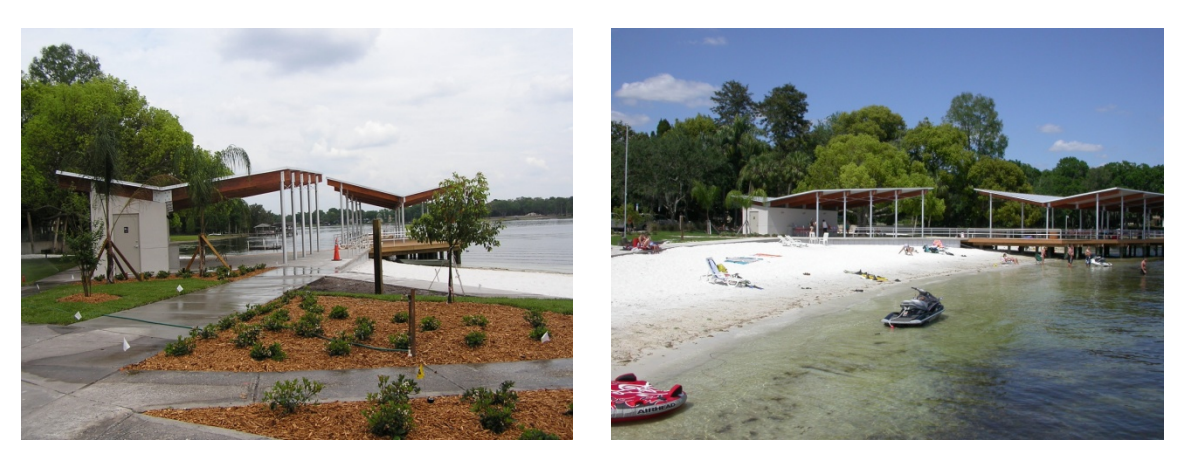
New pavilion, docks, and landscaping—May 2007 & April 2008