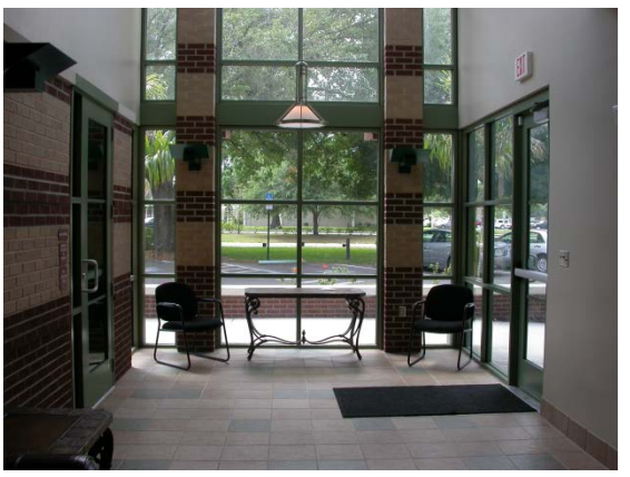
Entrance to lobby from McFarland Road