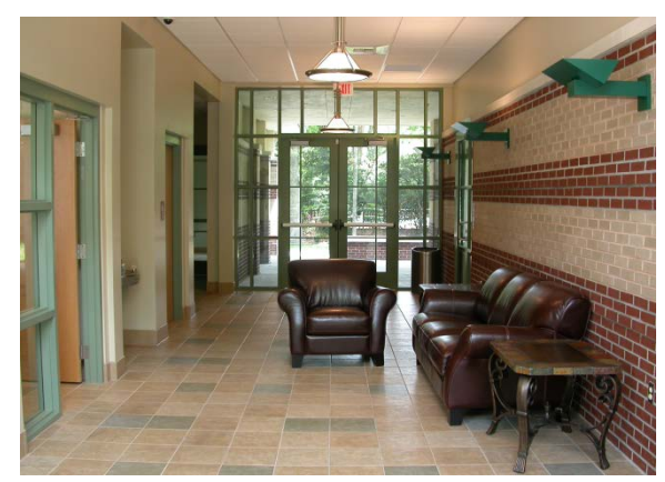
Entrance to lobby from tennis courts